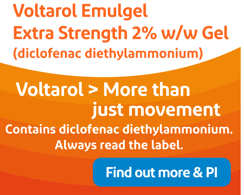
Static image | 1 URL only